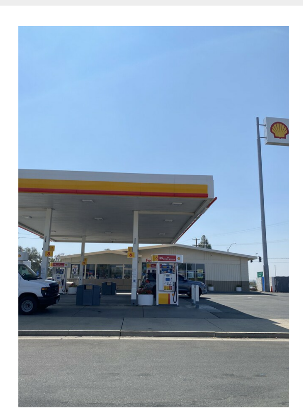
4746 Churn Creek Rd